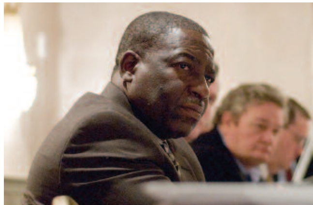
Lt. Governor Greg Francis (U.S. Virgin Islands)

In most cases, high school graduation requirements are not aligned with what is needed in college. A disconnect exists between state standards and the skills and knowledge necessary to succeed in college and workforce training programs. A national curriculum survey conducted by ACT, Inc., found that colleges generally want incoming students to attain in-depth understanding of a selected number of fundamental skills and knowledge in their high school courses, while high schools tend to provide less in-depth instruction of a broader range of skills and topics.