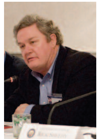
Lt. Governor Jack Dalrymple (ND)