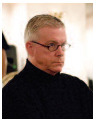
Lt. Governor Peter Kinder (MO)