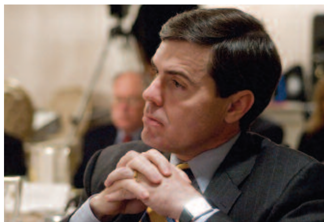
Lt. Governor Bill Halter (AR)

In a knowledge-based economy, innovation and excellence in mathematics and science are integral to a nation's competitiveness. Demands for skills in mathematics and science are continually increasing. Approximately half of America's fastest-growing businesses are high-tech firms. Skilled trade jobs, like construction and automotive repair, that traditionally required little background in math and science, now require higher-level skills. People who can handle a spreadsheet, read technical manuals, and solve complex problems are needed at all levels of industry.