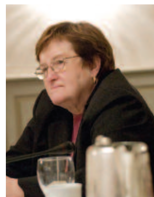
Lt. Governor Patty Judge (IA)