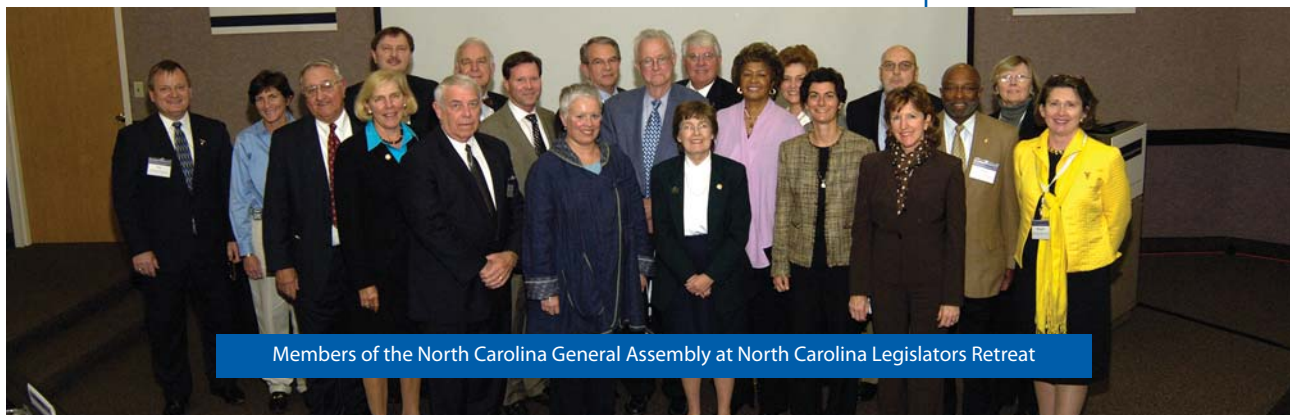
Members of the North Carolina General Assembly at North Carolina Legislators Retreat