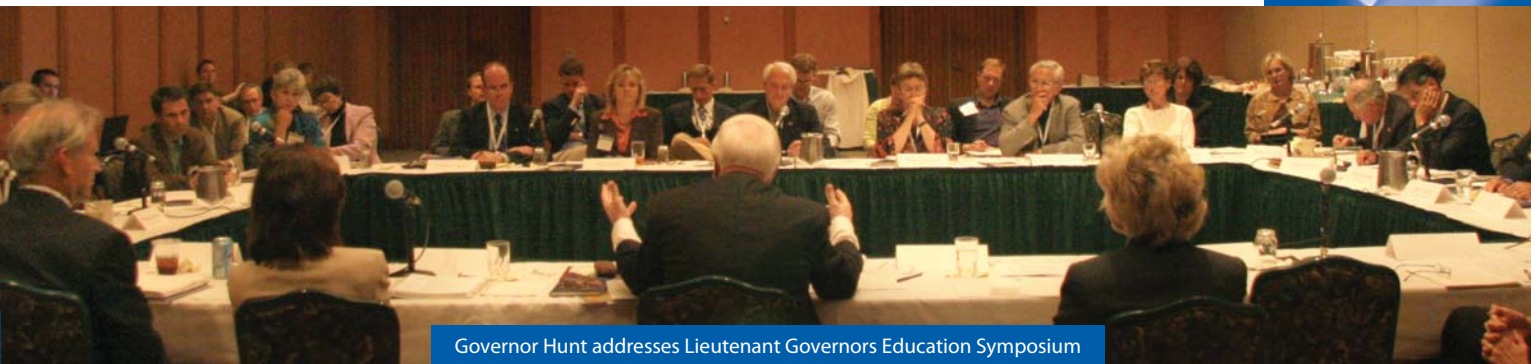
Governor Hunt addresses Lieutenant Governors Education Symposium