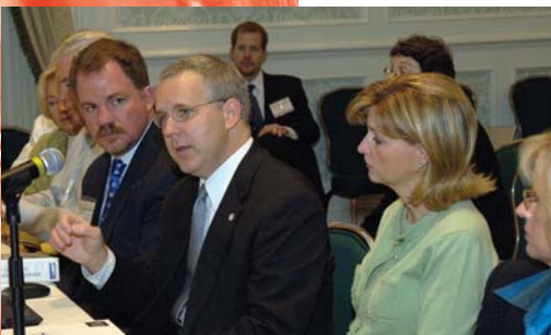
Oklahoma Governor Brad Henry (C) and Oklahoma First Lady Kim Henry

More and more governors have sought to earn a reputation as an “education governor” and candidates regularly campaign on education platforms. The same is true for lieutenant governors who are increasingly taking the reins with their own education agendas. When it comes to education improvements, Jim Hunt's stance is unmistakable: policymakers must be audacious. Throughout the year, the Hunt Institute connects governors and lieutenant governors with the foremost education and public policy experts – and with each other. The greatest impact is made by those leaders who have a clear sense of direction. The Hunt Institute works to provide this guidance through two key events: The Governors Education Symposium and the Lieutenant Governors Education Symposium .