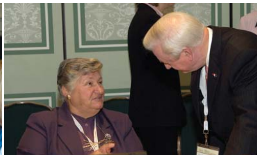
Delaware Governor Ruth Ann Minner and Former Governor Jim Hunt