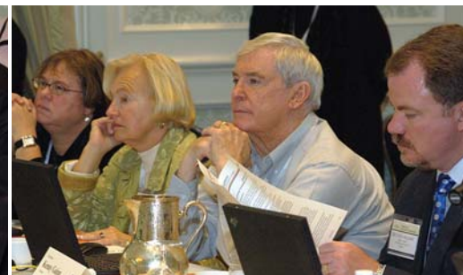
Rhode Island First Lady Sue Carcieri (C) and Nevada Governor Kenny Guinn