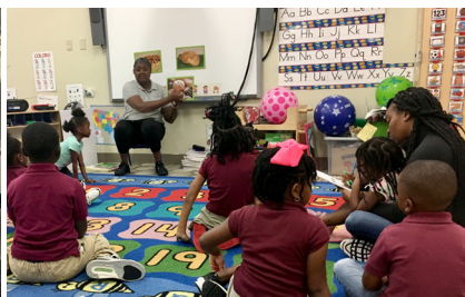
Guests toured classrooms to understand how the school creates a high-quality learning experience.