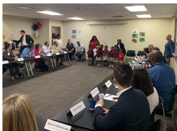
Students and their teachers gave guests a special welcome to start the morning.