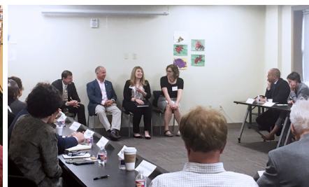
Panelists shared details about the blending and braiding of funding needed to start and sustain Educare schools.